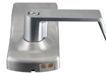
9V EMERGENCY BATTERY PORT