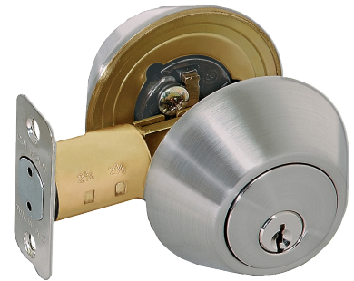
EDD-400 DOUBLE CYLINDER DEADBOLT