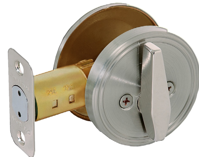
ID-801 ONE SIDED BOLT WITH COVER