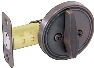
ID-701 ONE SIDED BOLT